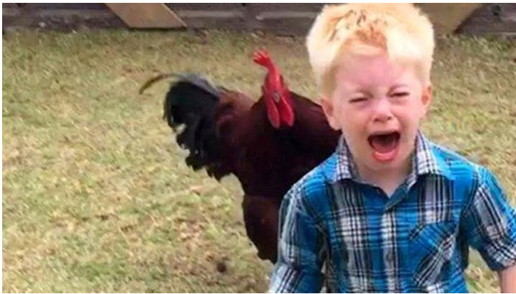
Alektorophobia is a rare condition characterized by an intense fear of chickens .